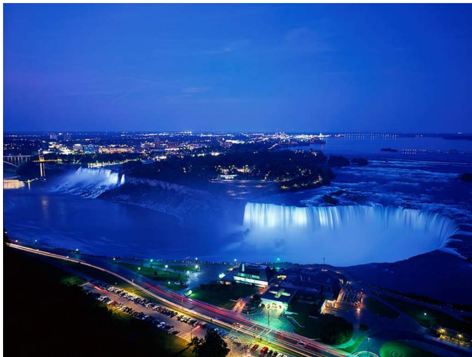
Niagara Falls at Night

To view the falls from another spectacular angle, take a 12-minute spin in a helicopter over the whole Niagara area. Helicopters leave from the heliport, adjacent to the whirlpool at the junction of Victoria Avenue and Niagara Parkway.