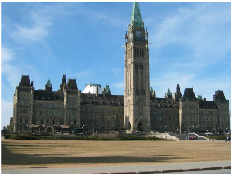
Canada's Parliament Building